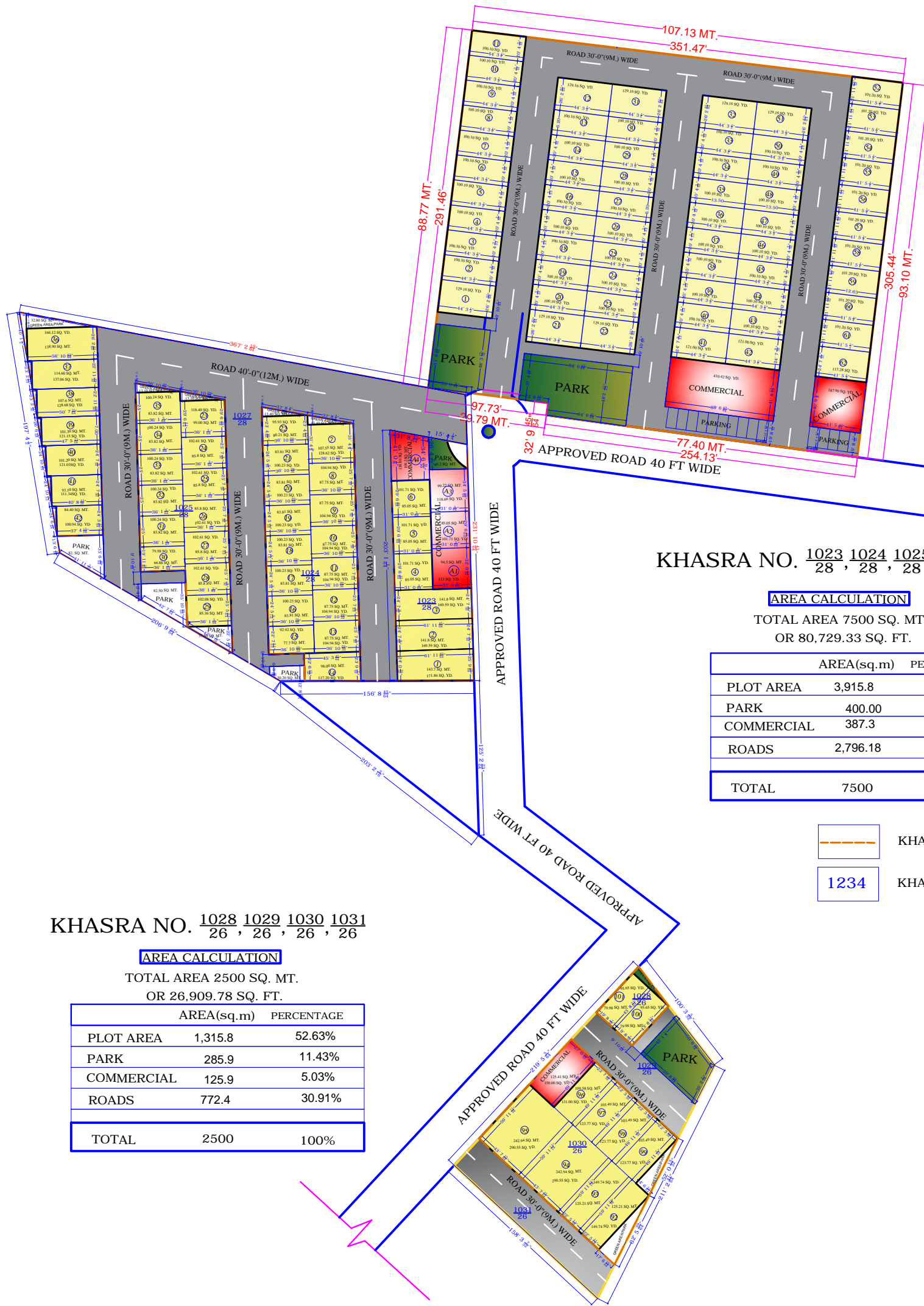
LAYOUT PLAN OF RESIDENTIAL PLOT AT KHASRA NO. 1234, SOTANALA , KOTPUTLI